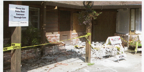
Former entrance—first steps of remodeling

Work on the new Fern Lodge entryway and reception area is progressing, though more slowly than expected. A major delay, and significant additional expense, resulted when we learned that we were required to provide a drainage system for the area where our garbage and recycling dumpsters are kept. That system soon will be in place, and we are ready to work on the original project, the new reception area and Fern Lodge entrance.