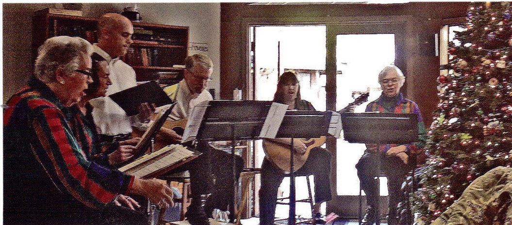
Pictured above are the Sunday Singers, who come each Christmas to sing at Fern Lodge.