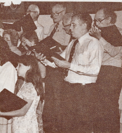
ave brightened many Fern Lodge.