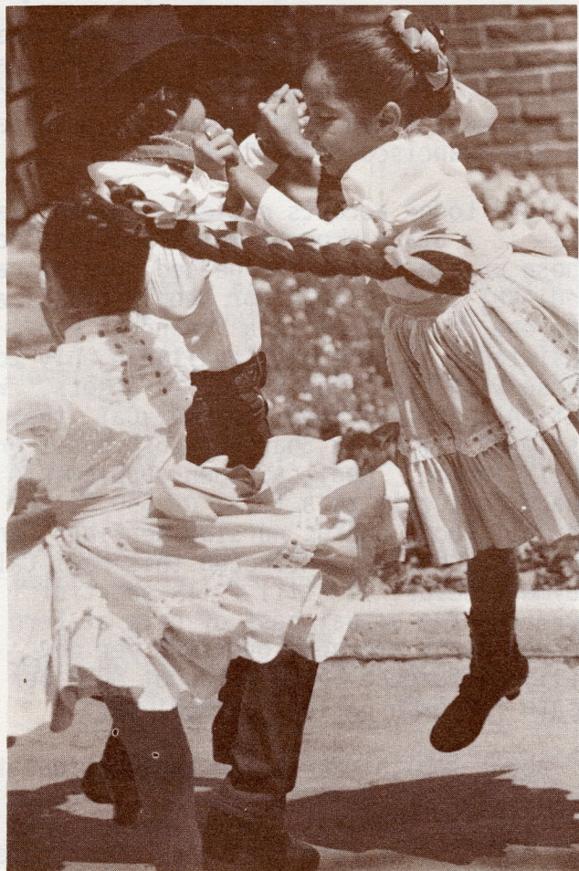
Swing your partner! Ballet Folklórico enlivened our Fiesta.