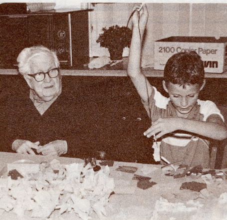
ly for their help with nelia's party.