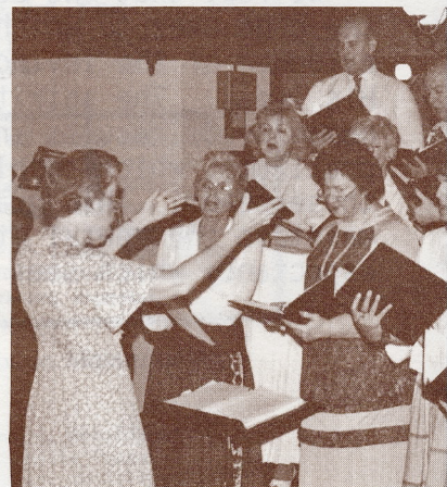
The Sunday Singers afternoons a