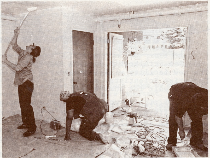
Many loving hands make work light.