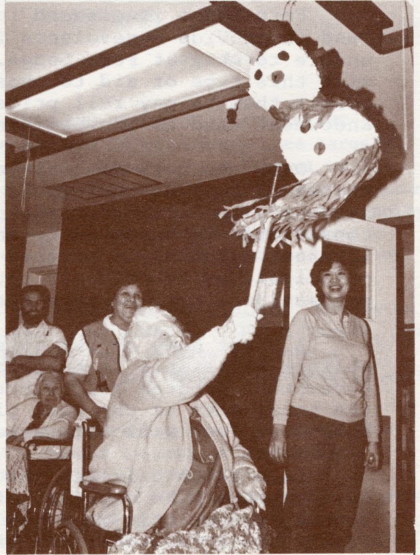
Farewell to Frosty, the Christmas piñata