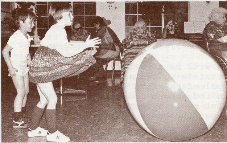
Joy keeps the ball rolling on Games 'n Kids Day