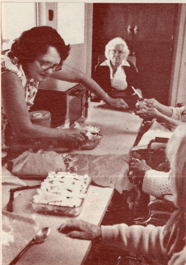
ABOVE: Guests participated by peeling apples for this tasty apple cobbler!