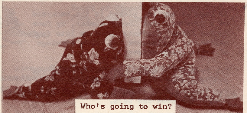
Who's going to win?