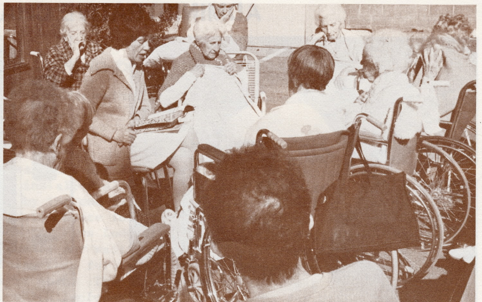
THE FIRST WARM DAYS OF SPRING ATTRACT PATIENTS AND NURSE TO OUTDOORS FOR BIBLE LESSON READING.