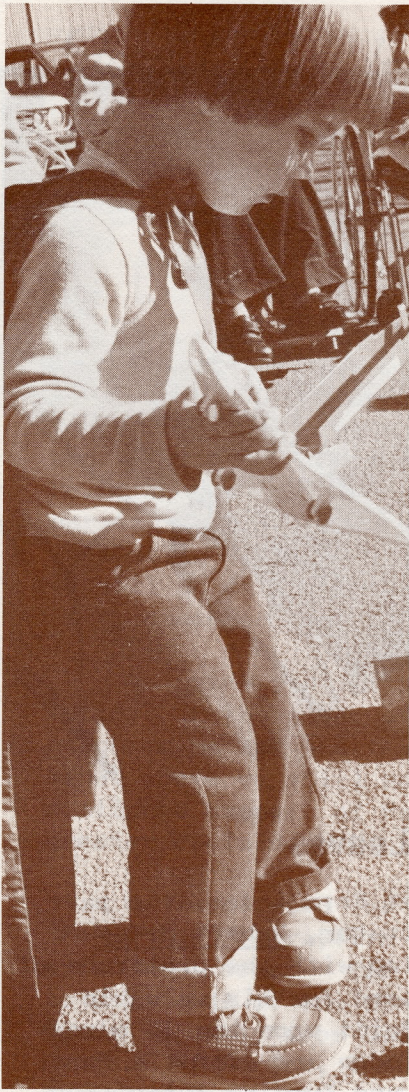
CONTINUANCE OF THE FLOCK PROGRAM SEES SHARED ENJOYMENT AND LEARNING.