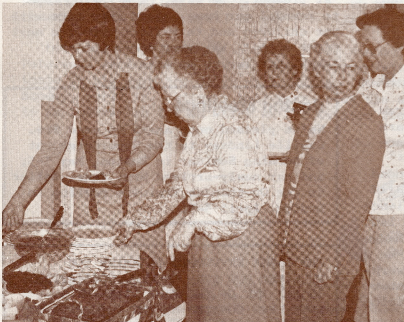
STAFF AND BOARD POTLUCK IT, AN IDEAL OPPORTUNITY TO ENJOY ONE ANOTHER WHILE UNENCUMBERED WITH BUSINESS.