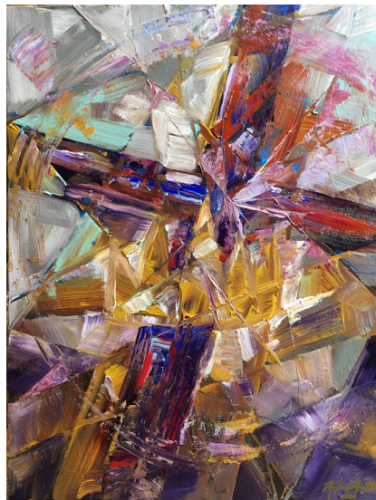
Cross & Crown 7