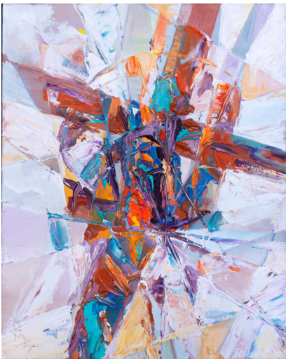
Cross & Crown 1

I am inspired by Mary Baker Eddy's statement: "To mortal sense Science seems at first obscure, abstract, and dark; but a bright promise crowns its brow. When understood, it is Truth's prism and praise" ( Science and Health with Key to the Scriptures , p.558). I love the idea of taking a familiar idea and fracturing it (cubist style) to show new dimensions of the idea, like refracting light in a prism or facets of a gemstone. This stained glass effect is not only beautiful and dynamic, but shows that there is so