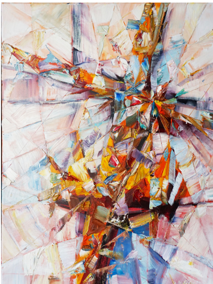
Cross & Crown 6