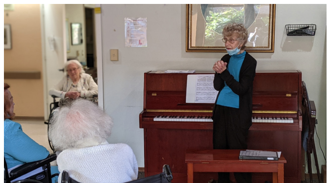
Piano playing every Friday