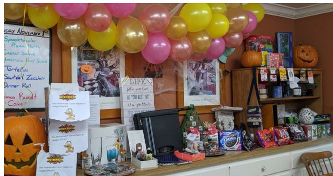
“General Store” at Fall Festival