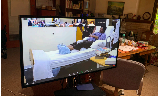
Students on Zoom

One unforeseen but wonderful benefit from holding Zoom classes was that 6 individuals who took a class remotely from smaller facilities (and in one case, with no facility at all) later asked if they could come to Fern Lodge for some mentoring! That's what we refer to as "Expected good from unexpected sources!" These all proved to be mutual blessings, adding skills to each student's ministry while providing a little grace in scheduling for our nursing floor. Deb Messmer has been our primary mentor, joyfully fulfilling that role in addition to her