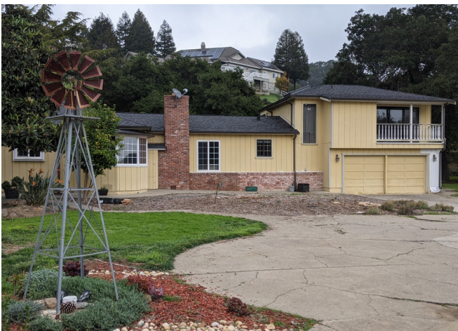
Valentine Home from the back