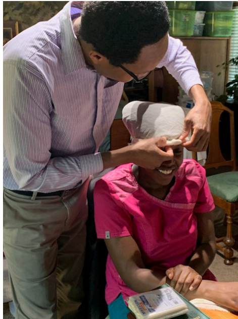
Practicing bandaging skills

Defining the nature of God in consciousness; feeling and applying the "practical possibilities of divine Love...." That sounds like a great job description for the Christian Science nurse! It is divine Love that motivates us to embark on a ministry of Christian Science nursing. Students learn more of the nature and practical possibilities of divine Love. And they learn how to apply these in skillful, helpful ways to meet daily needs for personal care, nourishment, mobility, bandaging, comfort, etc. The skills, ethics, and assessments acquired for their Christian Science nursing practice prepare them for endless possibilities and adaptations in this rewarding walk of life!